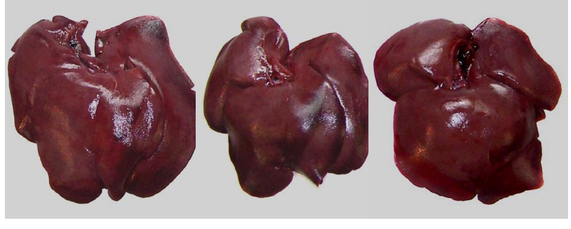
Figure 1. Representative livers from gilts in each treatment

a , b , c . Means within columns with no common superscripts differ significantly ( \cancel{P}0.05 )